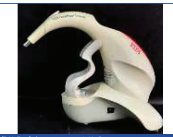
[Table/Fig-5]: Colour value assessed by Vita Easyshade.

study was equivalent to 7.4 months of clinical coffee consumption and its effects on composite restorations [18]. Tea solutions were prepared by dissolving 4 g of measured tea in 300 mL of hot water for 10 minutes [19]. Samples were submerged in the tea solution for seven days at 37°C after the tea solution had cooled for five minutes. Samples were also stored in coca-cola at 37°C for seven days [Table/Fig-6].