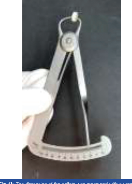
[Table/Fig-4]: The dimension of the pellets was measured with a vernier calliper.