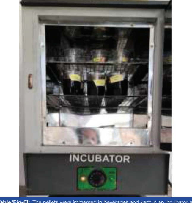
[Table/Fig-6]: The pellets were immersed in beverages and kept in an incubator at 37°C temperature for 7 days.

For statistical analysis, data were compiled in an Excel spreadsheet, and SPSS (version 20.0; SPSS Inc., Chicago, IL, USA) was used. Descriptive statistical analysis was performed to determine the means and standard deviations. One-way analysis of variance (oneway ANOVA) was conducted for numerical data to evaluate the means of three or more groups of samples, using the F distribution.